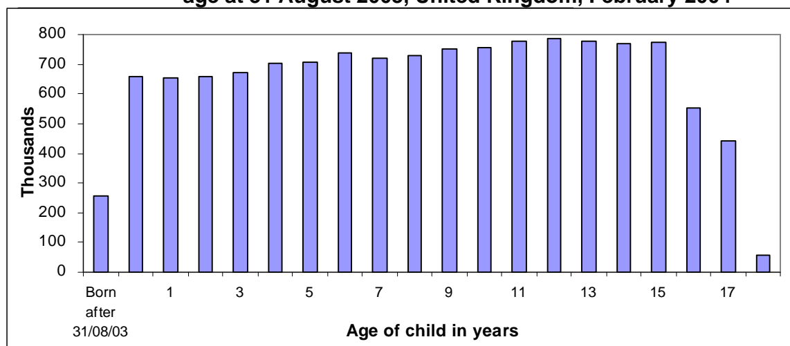
Chart 3 Children in families of Child Benefit recipients, by age at 31 August 2003, United Kingdom, February 2004