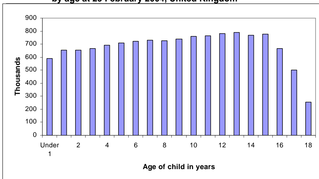
Chart 2 Children in families of Child Benefit recipients, by age at 29 February 2004, United Kingdom